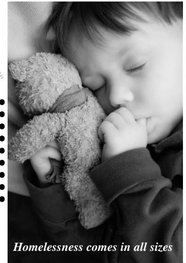
Homelessness comes in all sizes