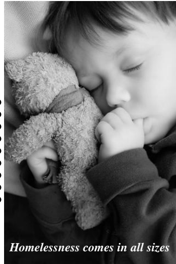
Homelessness comes in all sizes